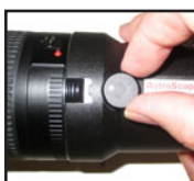
variable gain feature

The AstroScope is an advanced night vision module that incorporates a state-of-the-art image intensifier and high quality optics to transform dark scenes into bright, high resolution images. The AstroScope Models 9350NIK-SP and 9350NIK-SPV are specifically designed to be used with Nikon-type digital cameras. These modules mount seamlessly between the camera body and objective lenses using the standard Nikon bayonet mount and hot-shoe retaining all electronic communication between lens and camera. The Model 9350NIK-SP features an automatic gain control that keeps the output image at a certain brightness. The Model 9350NIK-SPV also features automatic gain control plus includes a manually adjustable maximum output brightness permitting the user to achieve the optimum balance of brightness and clarity in the image.