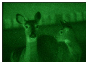
Low-light Still Photography