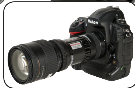
Also shown here on the Nikon D3X model

In wide use with military organizations around the world, AstroScope's battlefield-proven design delivers seamless integration with your camera body and requires no additional batteries or field adjustment, such as back focus. When you need to get the shot, AstroScope delivers.