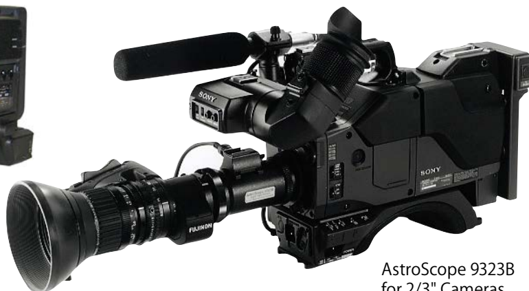
AstroScope 9323B for 2/3" Cameras