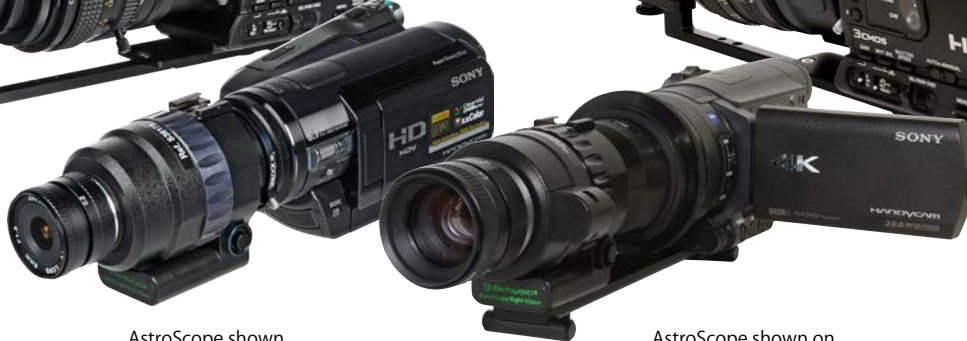
AstroScope shown on Sony AX-1 Handycam™ Video Camcorder