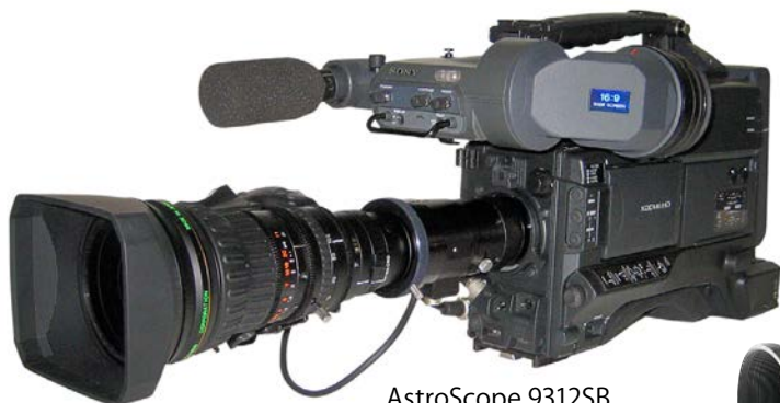
AstroScope 9312SB for 1/2" Sony Cameras