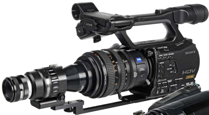
AstroScope shown on Sony Advanced/ Professional Camcorder