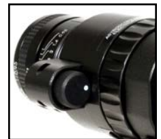
variable gain feature

We have models that feature automatic gain control plus includes a manually adjustable maximum output brightness permitting the user to achieve the optimum balance of brightness and clarity in the image.