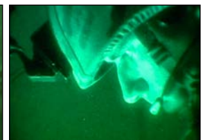
Electronic News Gathering